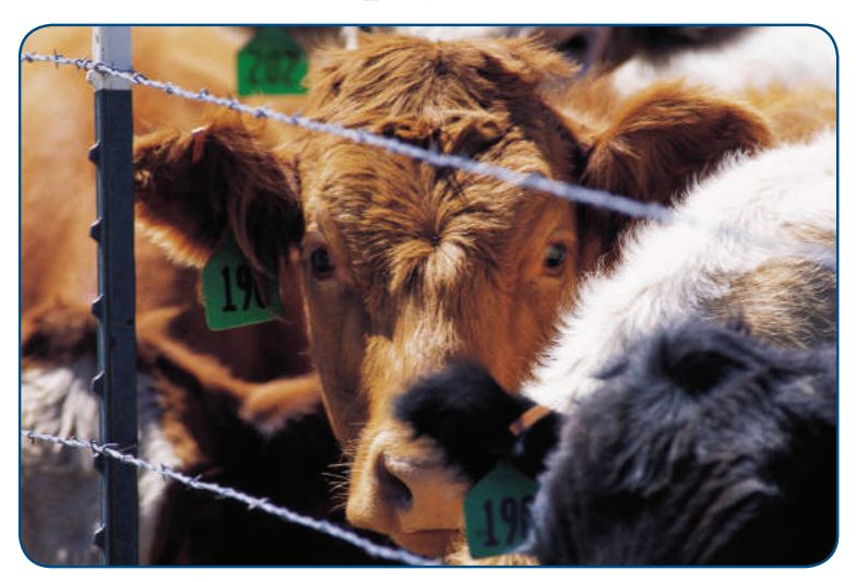
Meat, fish, poultry, and other animal products ure. would not be required to be labeled as bioengineered as a result of consuming bioengineered feed.

The Study of Electronic or Digital Disclosure Report can be found on the USDA Agricultural Marketing Service website at https://www.ams.usda.gov/ reports/study-electronic-or-digital-disclosure.