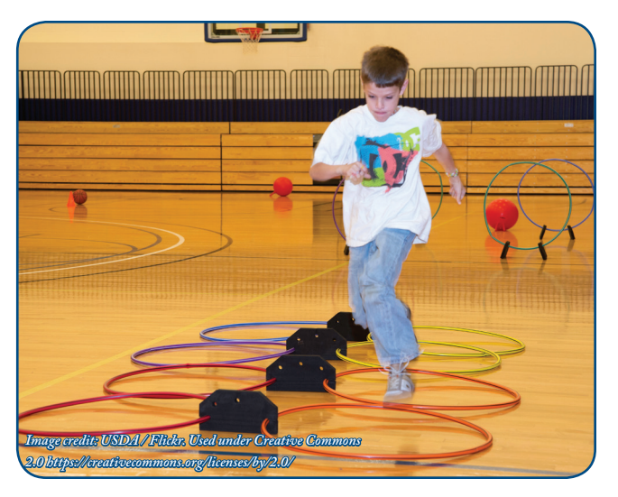
Students who reported receiving mostly As were more likely to be physically active.

For more information on CDC's school health efforts, visit www.cdc.gov/healthyyouth and www.cdc.gov/healthyschools/.