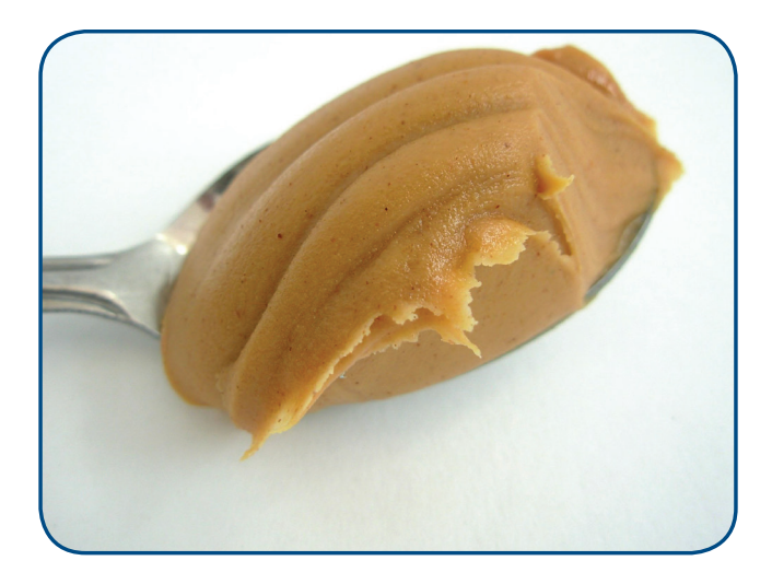
The prevalence of peanut allergy more than doubled between 1997 and 2008.

Published in 2015, the Learning Early About Peanut Allergy (LEAP) study involving more than 600 infants was the first randomized intervention trial to study early introduction to peanut