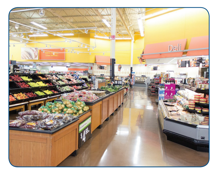
While nearly all national and regional grocery chains provide WiFi access, the study found this would be a significant barrier for small stores and ones located in rural areas.

The study found that the majority of Americans own a smartphone (77 percent) and ownership rates are trending upward. They also found that most Americans live in areas with sufficient broadband access (93.6 percent) to scan a digital link to access bioengineering food disclosure information. In fact, most national and regional chain stores (97 percent) already offer WiFi