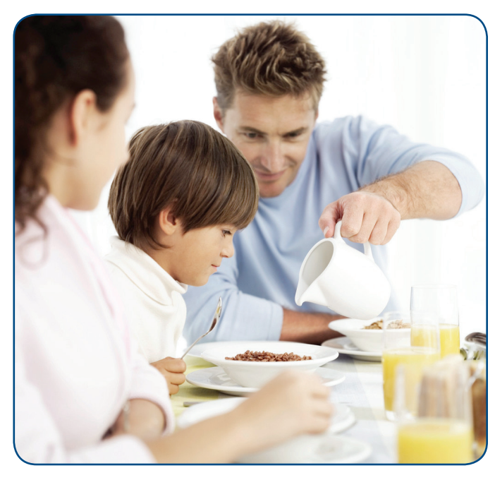
Try mixing a small amount of sugary cereal into a healthier whole-grain cereal.