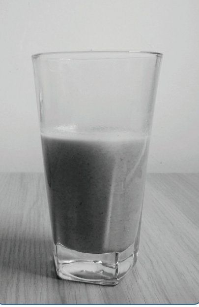
The nutritional drink was composed of carbohydrate, whey powder, and canola oil.

As the researchers hypothesized, the PET scans revealed that eating either meal resulted in the release of endorphins in the brain and that the participants rated the pizza meal as more delicious than the nutritional drink. Participants also indicated higher pleasure ratings following pizza compared to fasting. Unexpectedly, even though participants rated their pleasure lower after consuming the nutritional drink compared to the twelve-hour fast, the nutritional drink resulted in significantly larger increases in endorphins compared to the pizza.