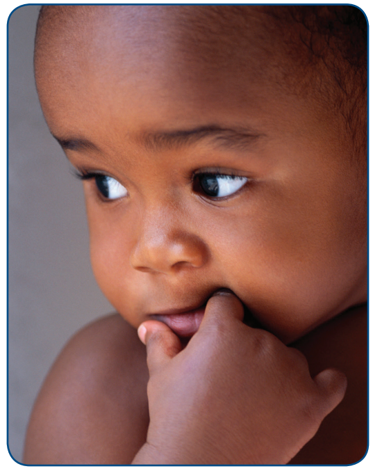
If your infant has severe eczema and/or egg allergy, check with your infant's healthcare provider before feeding foods containing ground peanuts.