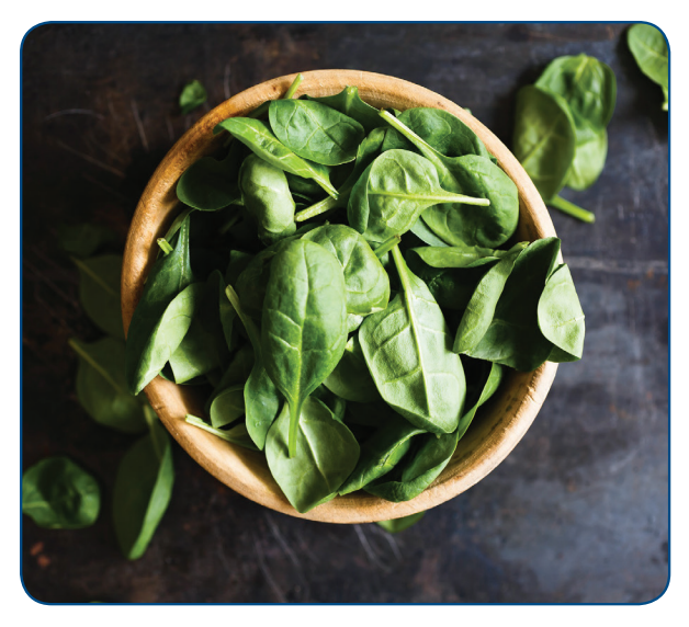
Dark leafy greens, such as spinach, are an excellent source of folate.

In the paper, which used data from the Childhood Autism Risks from Genetics and the Environment (CHARGE) study, researchers looked at 296 children between 2 and 5 who had been diagnosed with ASD and 220 who had developed typically. Mothers were interviewed about their household pesticide exposure during pregnancy, as well as their folic acid and B vitamin intake.