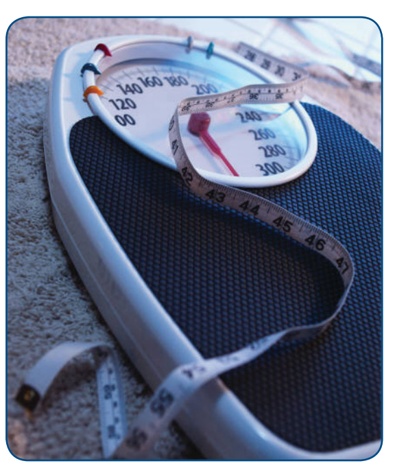
Currently there is no consensus on what the criteria should be for diagnosing metabolic syndrome in children.

The Utility of Defining Metabolic Syndrome in Children