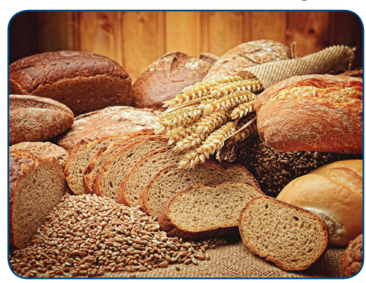
The majority of processed grain products have been fortified with folic acid.

"It would be better for women to avoid chronic pesticide exposure if they can while pregnant," Schmidt said.